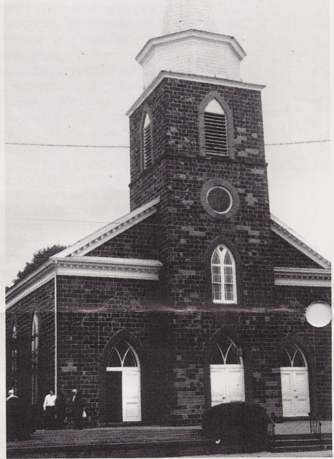
Part of the gathered family at the 57th Annual Meeting